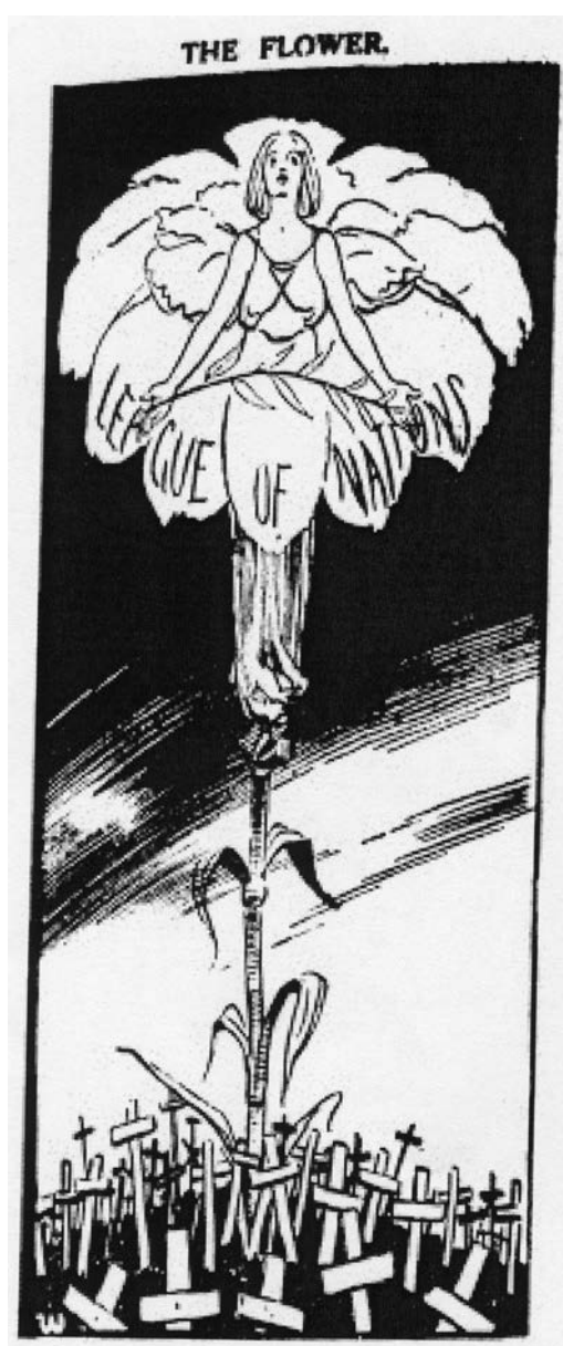
A British cartoon published in November 1919.

From an article by a member of the British government, published in 1924.