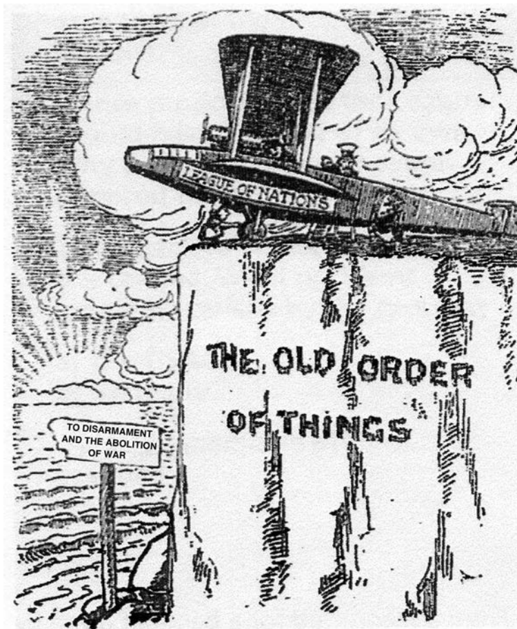
A British cartoon published in 1919.

The League needs to provide the means for the common action which will have to be exercised by the Council. I need hardly point out the League lacks the means of control or police that would make its decisions effective. We all want our action to be effective; we do not want anybody to ridicule us. We desire security. I am bound to say that at the present moment we do not feel that the safeguards are adequate.